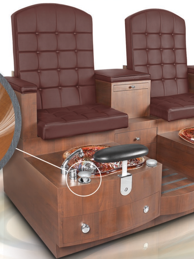
GULFSTREAM Air Vent System Adjustable